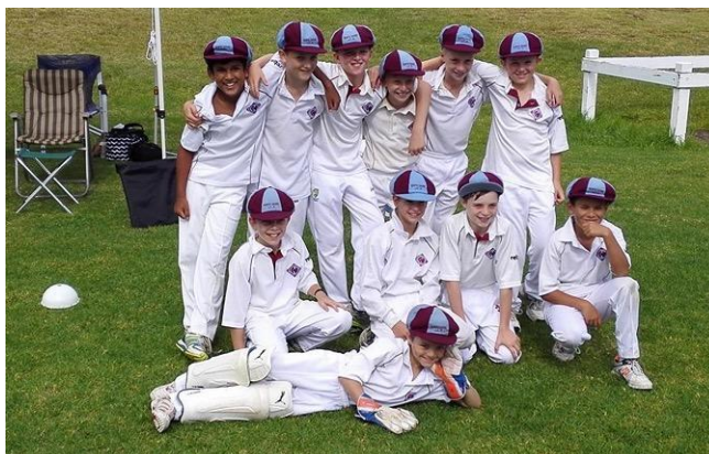
U11 Presidents Cup Champion Team

IDCA (Presidents Cup) Reps: The Inter District Cricket Association (IDCA) runs this rep competition designed to give players with potential the opportunity to play the game at a level between the Association and DCA standard.